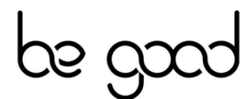
BE GOOD PAKISTAN