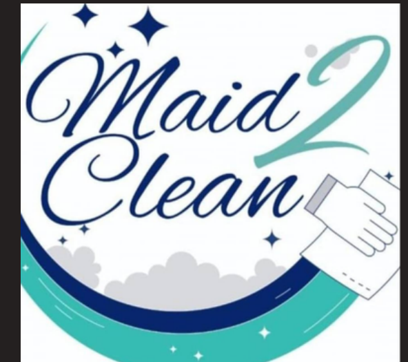
MAID 2 CLEAN