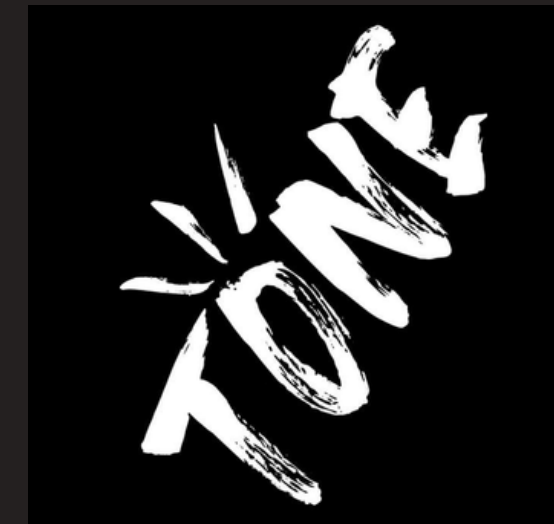
TONE BODY SPRAY